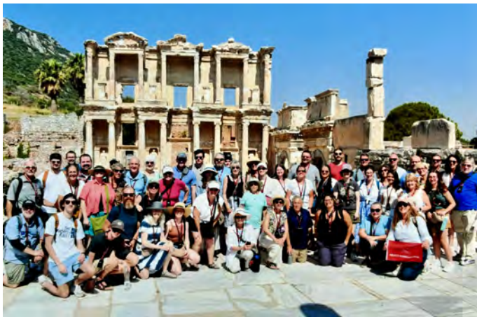
GREECE & TURKEY, 2024

locals, trod on old soil, and spend time each day unpacking what we've learned, usually over a local drink.